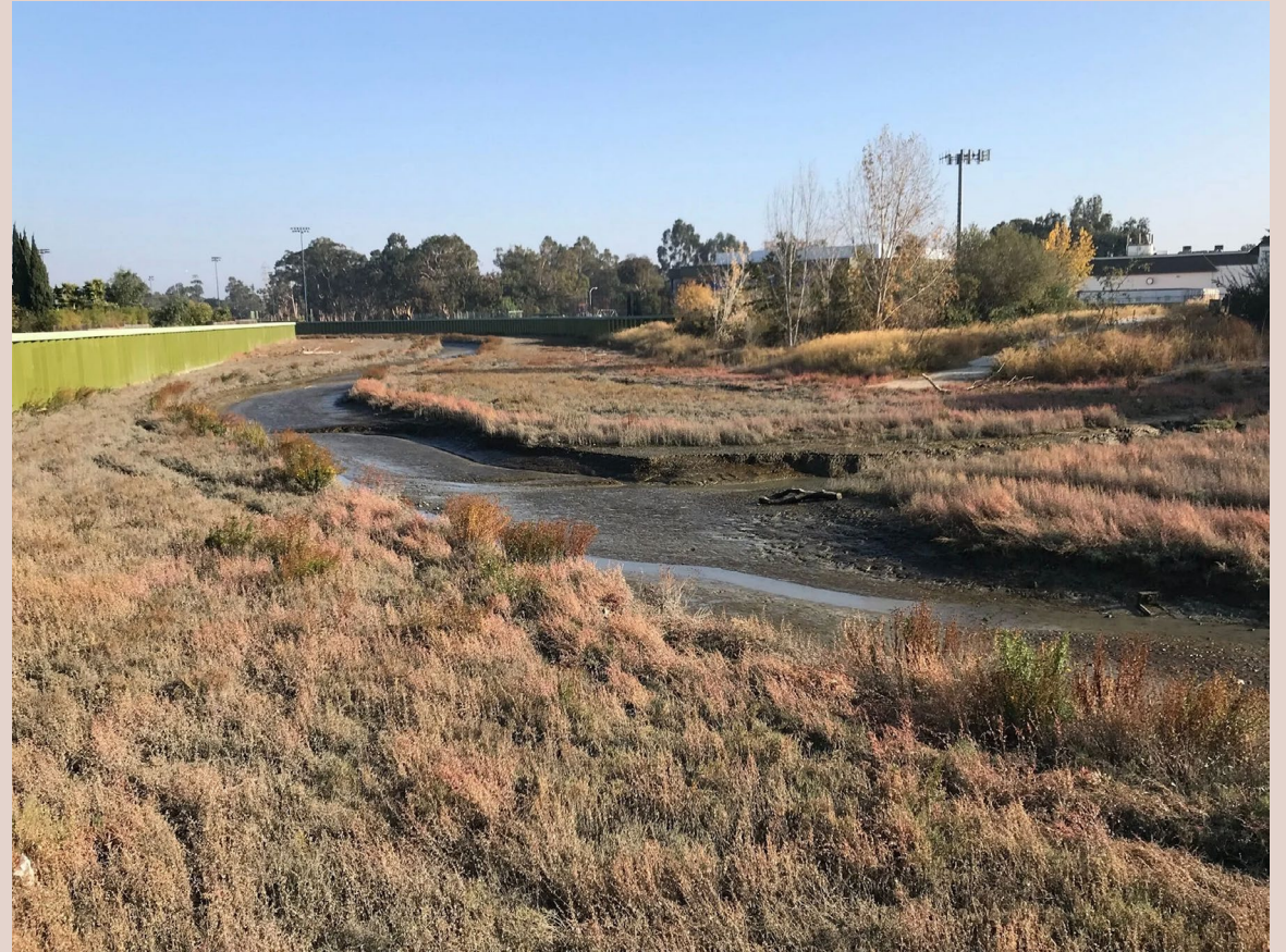
Reach 1 Project Area

We are coordinating with our members and with WRA to accelerate the channel widening components downstream of the University Avenue bridge.