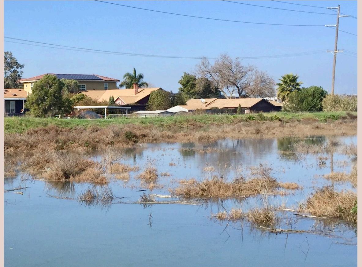
High tide, north of Bay Road.

We are on track to bring the EIR to the Board at the May 28 Board meeting for consideration for certification.