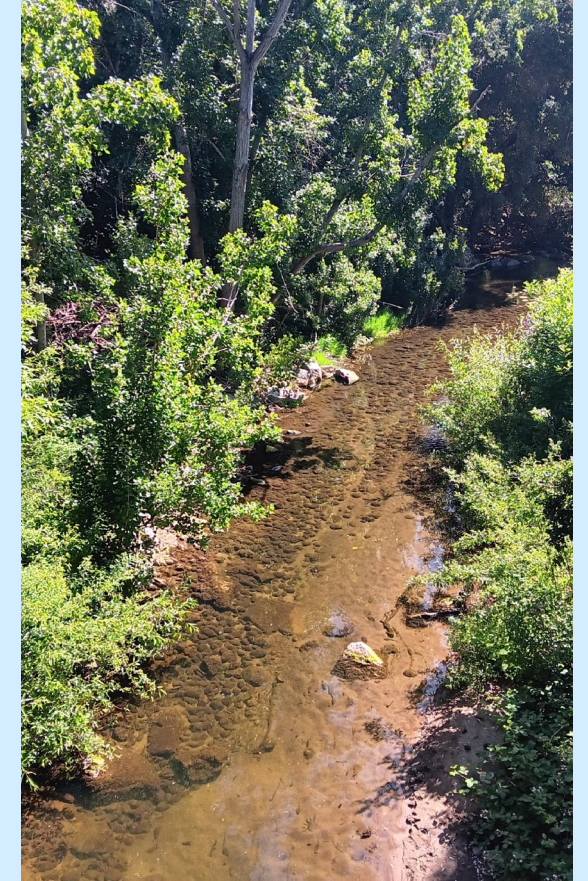
Aerial view of the San Francisquito Creek